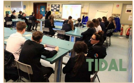
Development Education in Ireland

"My hope and wish is that, one day, formal education will pay attention to what I call education of the heart. Just as we take for granted the need to acquire proficiency in the basic academic subjects, I am hopeful that a time will come when we can take it for granted that children will learn, as part of their school curriculum, the indispensability of inner values such as love, compassion, justice, and forgiveness." ~Dalai Lama