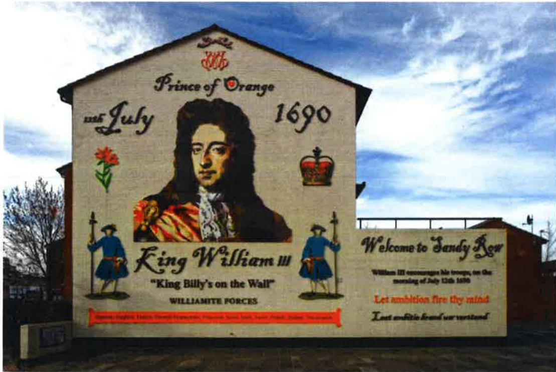
Appendix L (Paramilitary murals in Belfast also depicting the red hand of Ulster)