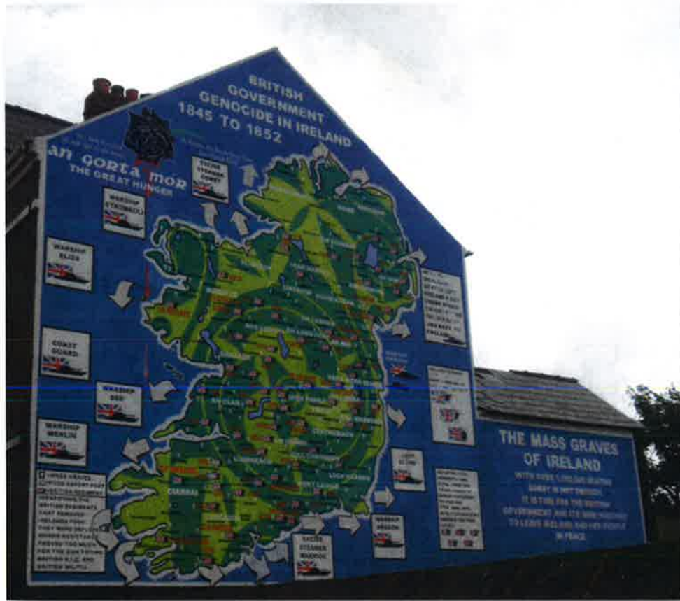
Appendix J (International Wall, Falls Road, Belfast)