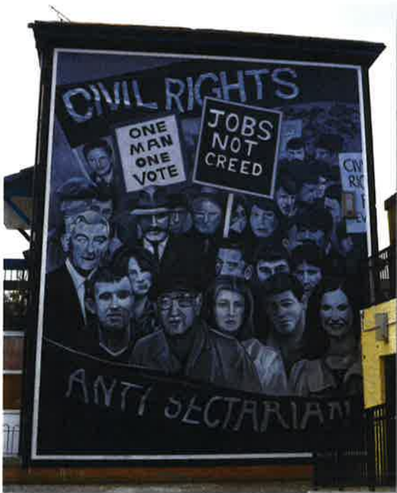
Appendix A (Civil Rights: The Beginning)