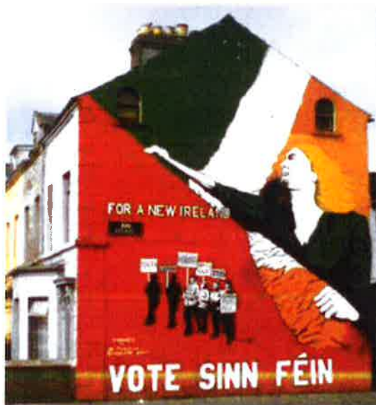
Appendix G (Sinn Féin mural)